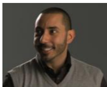
From top to bottom: Hookers on Davie, 1984 ; Des gens comme nous, 2010 ; Not a Love Story: A Film About Pornography, 1981 ; Je sais pas si vous êtes comme moi, 2006 .

Excitement is mounting for the upcoming launch of two video compilations created thanks to the hard work of several partners and collaborators over the last year.